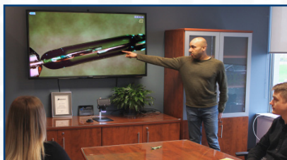
Aven's Dual Gooseneck LED Task Light